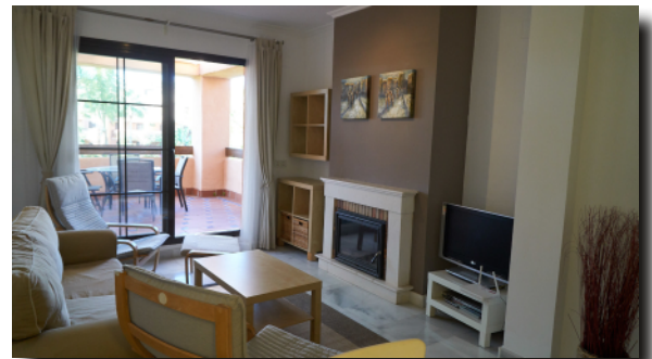
Spacious living room

Within walking distance of the Beach as well as many restaurants, shopping and bus stop this is a perfect location for those who don't want to depend on a car during their stay. However included is one private parking space in the garage.